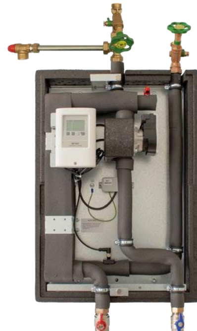
Illustration with insulation

Control and sensors: Speed-controlled regulation ensures that the cold water temperature remains constant. Modern sensors, such as the vortex flow sensor, accurately measure the flow rate and cold water temperature.