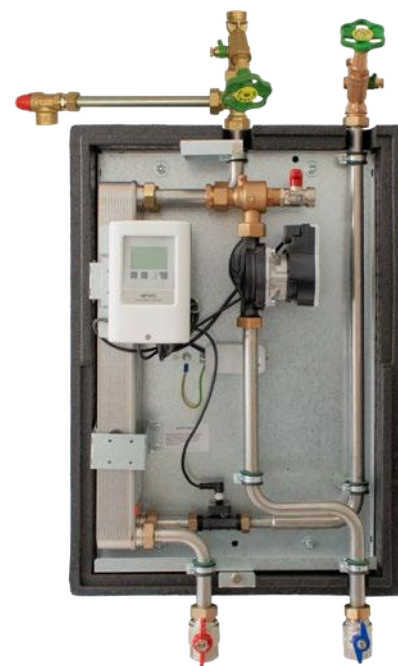
Illustration without insulation